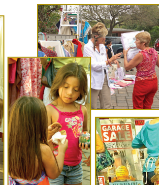
Garage Sale Shoppers in Training

The Torch is produced by Sandra Johnston Graphics, LLC and printed by Magic Print Copy Center