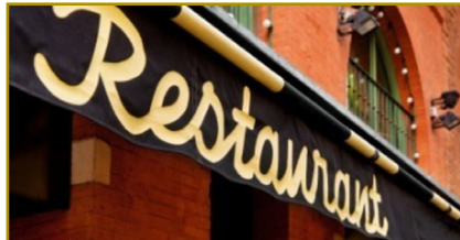
Dining Gift Cards