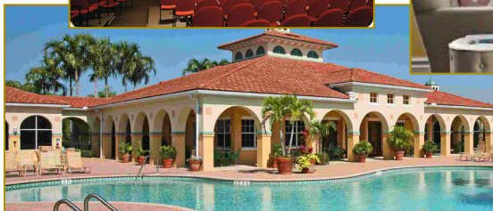
Weekend Get Aways