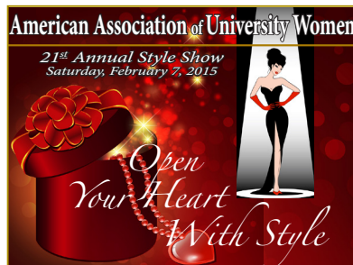
Fashion Show story on page 2.