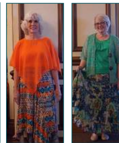
New members modeled