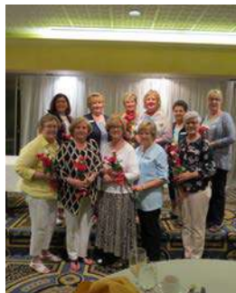
New Board Members