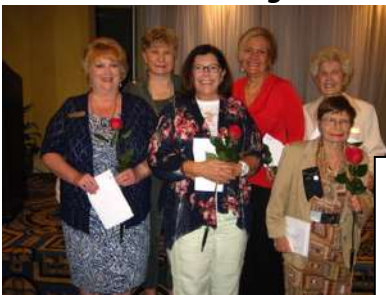
Recipients of the Eleanor Roosevelt Award for Outstanding service to our branch of AAUW