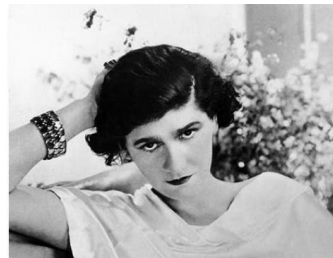
Coco Chanel (1883-1971)