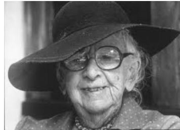
Marjory Stoneman Douglas 1890-1998

"Fashion fades, only style remains the same."