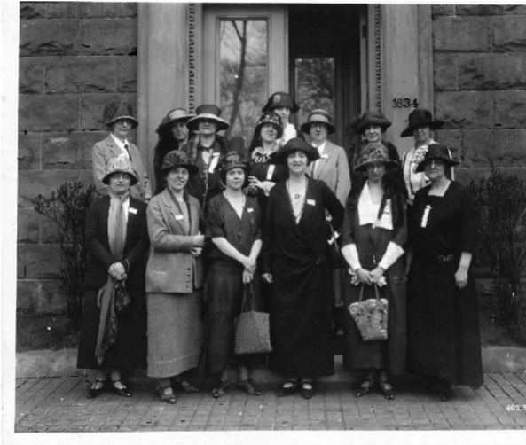
PHOTO OF MEMBERS OF AAUW AT THE BEGINNING OF THE 20 TH CENTURY

At its onset, the group's founders envisioned an organization where women college graduates could band together to open the doors of higher education to other women and to find wider opportunities for their professional training. Throughout its history, AAUW has examined and taken positions on such fundamental issues as women's role in education, society, economics, and politics.